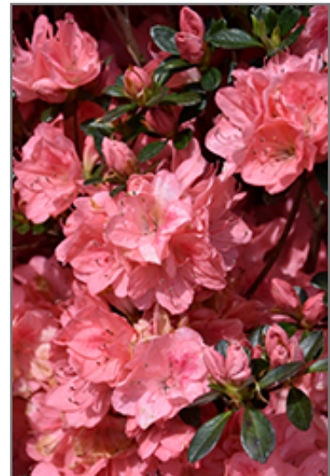
Blaauw's Pink Azalea flowers

Blaauw's Pink Azalea will grow to be about 4 feet tall at maturity, with a spread of 4 feet. It tends to be a little leggy, with a typical clearance of 1 foot from the ground. It grows at a slow rate, and under ideal conditions can be expected to live for 40 years or more.