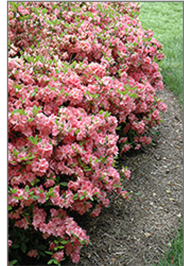
Blaauw's Pink Azalea in bloom