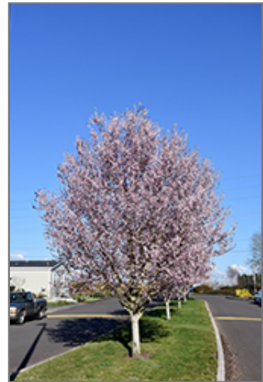
Krauter Vesuvius Plum in bloom