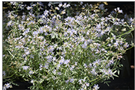
Touch Of Class Jacob's Ladder flowers