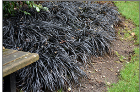
Black Mondo Grass