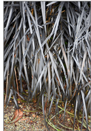
Black Mondo Grass foliage

Black Mondo Grass is a fine choice for the garden, but it is also a good selection for planting in outdoor pots and containers. It is often used as a 'filler' in the 'spiller-thriller-filler' container combination, providing a mass of flowers and foliage against which the thriller plants stand out. Note that when growing plants in outdoor containers and baskets, they may require more frequent waterings than they would in the yard or garden.