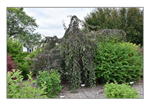
Ruby Tears Flowering Crab

Ruby Tears Flowering Crab is a dense multi-stemmed deciduous shrub with a rounded form and gracefully weeping branches. Its average texture blends into the landscape, but can be balanced by one or two finer or coarser trees or shrubs for an effective composition.