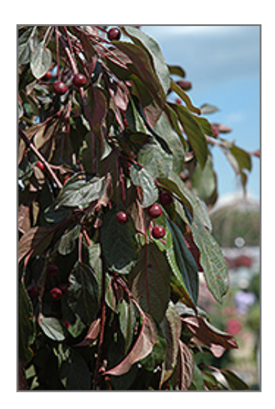
Ruby Tears Flowering Crab fruit

This shrub will require occasional maintenance and upkeep, and is best pruned in late winter once the threat of extreme cold has passed. It has no significant negative characteristics.