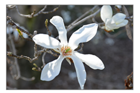
Anise Magnolia flowers