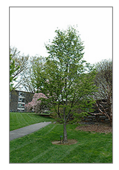
Anise Magnolia