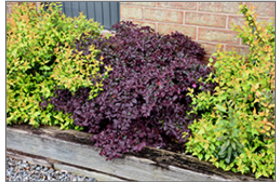
Purple Pixie Fringeflower