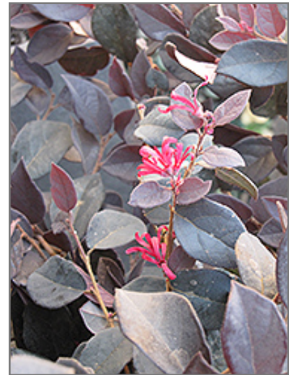
Purple Pixie Fringeflower flowers