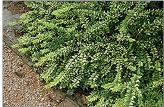
Edmee Gold Honeysuckle