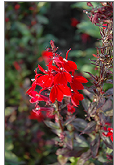
Queen Victoria Lobelia flowers