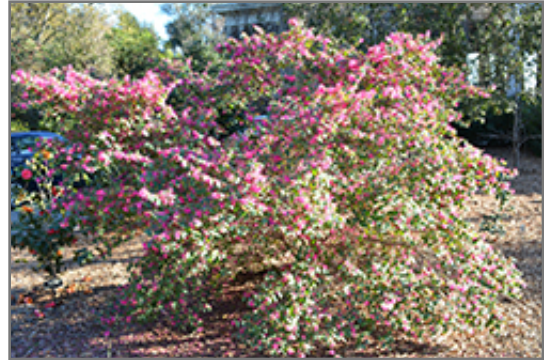
Razzleberri Fringeflower in bloom

This shrub does best in full sun to partial shade. It prefers to grow in average to moist conditions, and shouldn't be allowed to dry out. It may require supplemental watering during periods of drought or extended heat. It is particular about its soil conditions, with a strong preference for rich, acidic soils. It is somewhat tolerant of urban pollution. Consider applying a thick mulch around the root zone in winter to protect it in exposed locations or colder microclimates. This is a selected variety of a species not originally from North America.