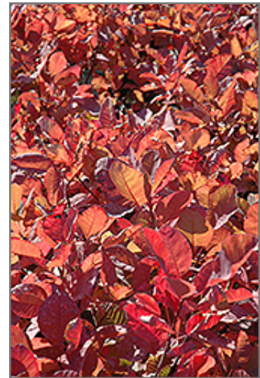
Grace Smokebush in fall

This shrub should only be grown in full sunlight. It is very adaptable to both dry and moist locations, and should do just fine under average home landscape conditions. It may require supplemental watering during periods of drought or extended heat. It is not particular as to soil type or pH. It is highly tolerant of urban pollution and will even thrive in inner city environments, and will benefit from being planted in a relatively sheltered location. This particular variety is an interspecific hybrid.