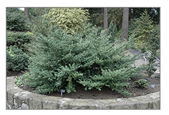
Convex-Leaf Japanese Holly

Convex-Leaf Japanese Holly is recommended for the following landscape applications;