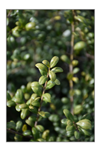
Convex-Leaf Japanese Holly foliage