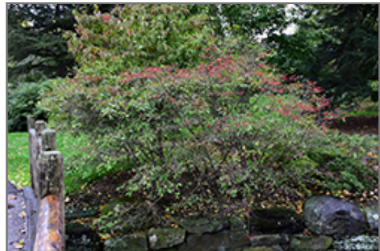
Autumn Glow Winterberry Holly fruit

Autumn Glow Winterberry Holly is recommended for the following landscape applications;