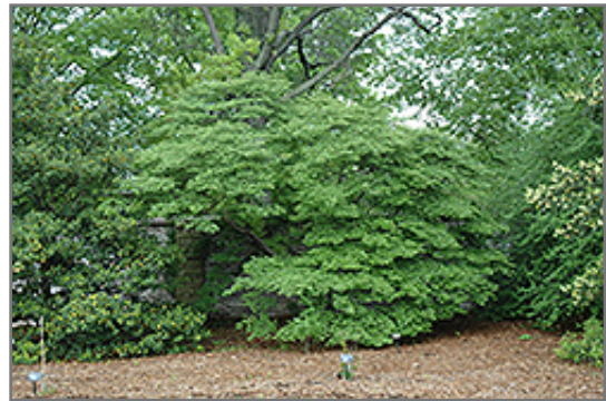
Autumn Glow Winterberry Holly

Autumn Glow Winterberry Holly will grow to be about 8 feet tall at maturity, with a spread of 10 feet. It tends to be a little leggy, with a typical clearance of 1 foot from the ground, and is suitable for planting under power lines. It grows at a medium rate, and under ideal conditions can be expected to live for 40 years or more. This is a female variety of the species which requires a male selection of the same species growing nearby in order to set fruit.