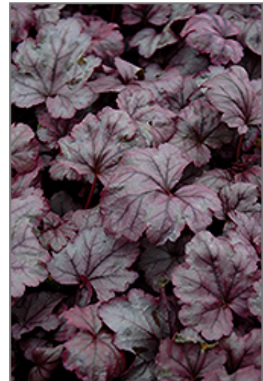
Plum Royale Coral Bells foliage

Plum Royale Coral Bells is recommended for the following landscape applications;