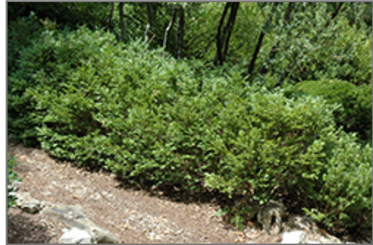
Inglis Boxwood