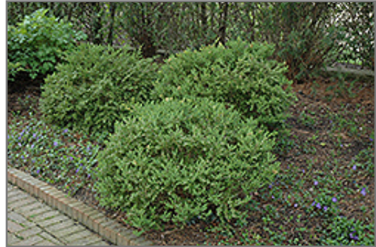
Wintergreen Boxwood