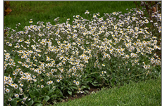
Lynnhaven Carpet Fleabane in bloom