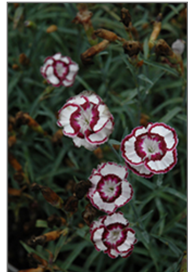
Raspberry Swirl Pinks flowers

Raspberry Swirl Pinks is recommended for the following landscape applications;