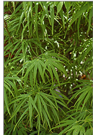
Scolopendrifolium Japanese Maple foliage

Scolopendrifolium Japanese Maple is recommended for the following landscape applications;