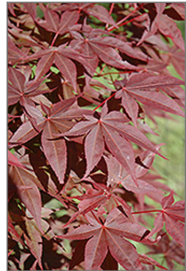
Red Spray Japanese Maple foliage

Red Spray Japanese Maple will grow to be about 20 feet tall at maturity, with a spread of 20 feet. It has a low canopy with a typical clearance of 2 feet from the ground, and is suitable for planting under power lines. It grows at a slow rate, and under ideal conditions can be expected to live for 60 years or more.