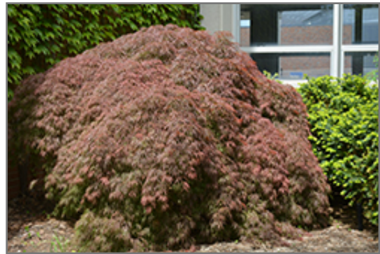
Red Select Japanese Maple

This tree does best in a location that gets morning sunlight but is shaded from the hot afternoon sun, although it will also grow in partial shade. Keep it away from hot, dry locations that receive direct afternoon sun or which get reflected sunlight, such as against the south side of a white wall. It prefers to grow in average to moist conditions, and shouldn't be allowed to dry out. It may require supplemental watering during periods of drought or extended heat. It is not particular as to soil pH, but grows best in rich soils. It is somewhat tolerant of urban pollution, and will benefit from being planted in a relatively sheltered location. Consider applying a thick mulch around the root zone in winter to protect it in exposed locations or colder microclimates. This is a selected variety of a species not originally from North America.