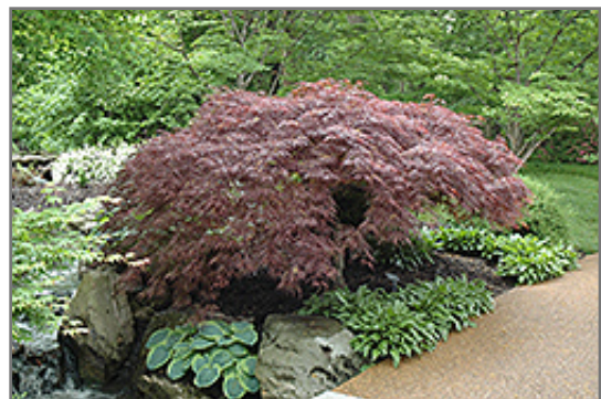
Red Select Japanese Maple