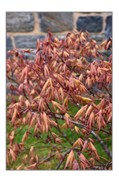
Aka Shigitatsu Sawa Japanese Maple foliage

This tree does best in a location that gets morning sunlight but is shaded from the hot afternoon sun, although it will also grow in partial shade. Keep it away from hot, dry locations that receive direct afternoon sun or which get reflected sunlight, such as against the south side of a white wall. It prefers to grow in average to moist conditions, and shouldn't be allowed to dry out. It may require supplemental watering during periods of drought or extended heat. It is not particular as to soil pH, but grows best in rich soils. It is somewhat tolerant of urban pollution, and will benefit from being planted in a relatively sheltered location. Consider applying a thick mulch around the root zone in winter to protect it in exposed locations or colder microclimates. This is a selected variety of a species not originally from North America.