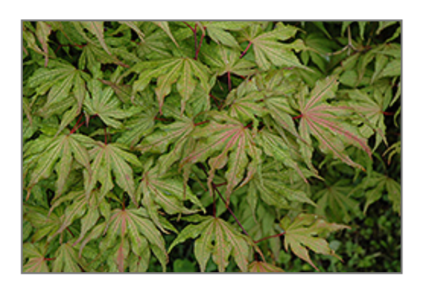
Aka Shigitatsu Sawa Japanese Maple foliage

Aka Shigitatsu Sawa Japanese Maple is recommended for the following landscape applications;