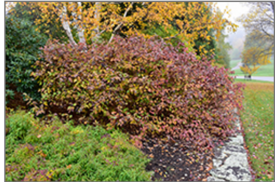
Bailey Red-Twig Dogwood in fall