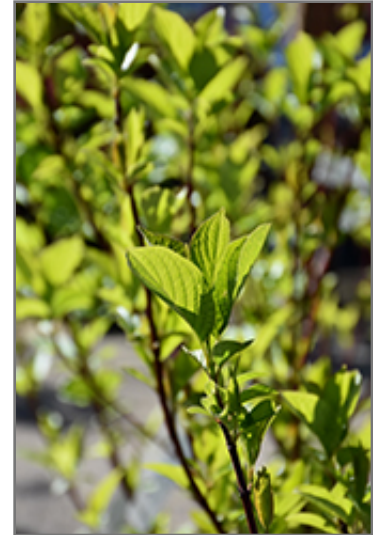
Bailey Red-Twig Dogwood foliage

This shrub does best in full sun to partial shade. It is an amazingly adaptable plant, tolerating both dry conditions and even some standing water. It may require supplemental watering during periods of drought or extended heat. It is not particular as to soil type or pH. It is highly tolerant of urban pollution and will even thrive in inner city environments. This species is native to parts of North America.