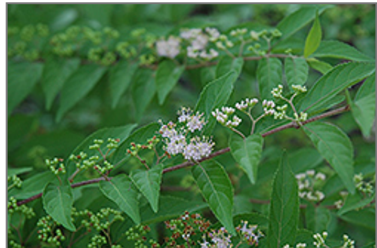
Issai Beautyberry flowers

Issai Beautyberry makes a fine choice for the outdoor landscape, but it is also well-suited for use in outdoor pots and containers. Because of its height, it is often used as a 'thriller' in the 'spiller-thriller-filler' container combination; plant it near the center of the pot, surrounded by smaller plants and those that spill over the edges. It is even sizeable enough that it can be grown alone in a suitable container. Note that when grown in a container, it may not perform exactly as indicated on the tag - this is to be expected. Also note that when growing plants in outdoor containers and baskets, they may require more frequent waterings than they would in the yard or garden.