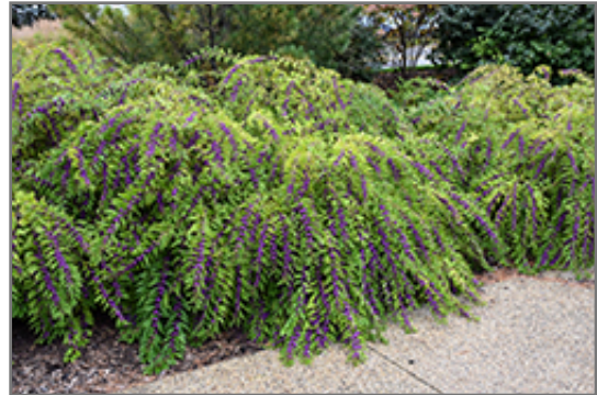
Issai Beautyberry fruit