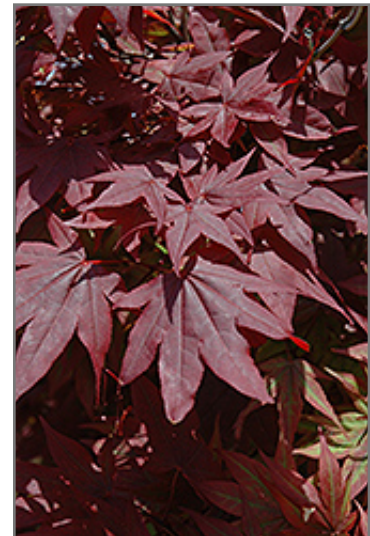
Oshio Beni Japanese Maple foliage

Oshio Beni Japanese Maple is recommended for the following landscape applications;