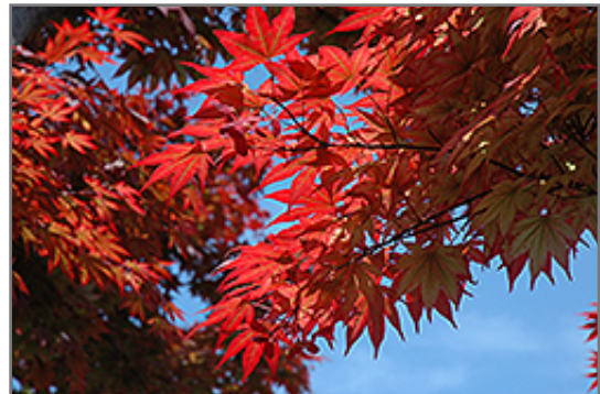
Oshio Beni Japanese Maple foliage

This tree does best in a location that gets morning sunlight but is shaded from the hot afternoon sun, although it will also grow in partial shade. Keep it away from hot, dry locations that receive direct afternoon sun or which get reflected sunlight, such as against the south side of a white wall. It prefers to grow in average to moist conditions, and shouldn't be allowed to dry out. It may require supplemental watering during periods of drought or extended heat. It is not particular as to soil pH, but grows best in rich soils. It is somewhat tolerant of urban pollution, and will benefit from being planted in a relatively sheltered location. Consider applying a thick mulch around the root zone in winter to protect it in exposed locations or colder microclimates. This is a selected variety of a species not originally from North America.