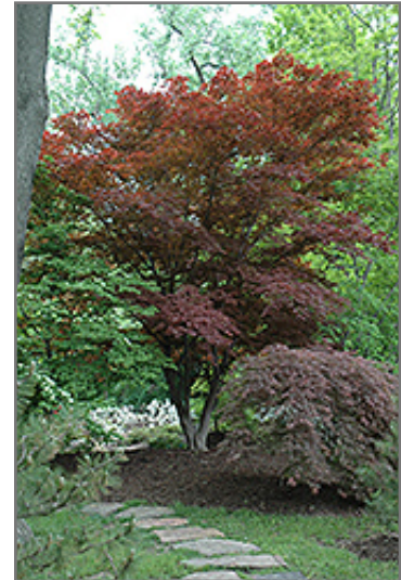
Oshio Beni Japanese Maple