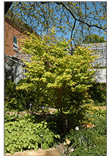
Coral Bark Japanese Maple