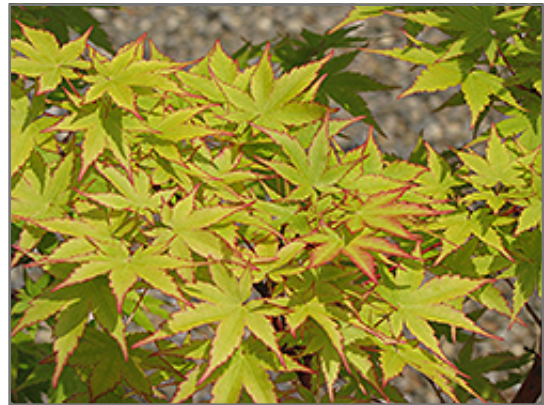
Coral Bark Japanese Maple foliage

Coral Bark Japanese Maple is recommended for the following landscape applications;