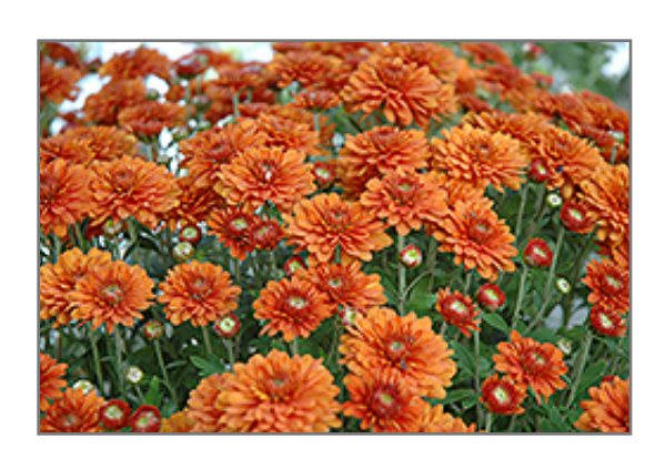
Hannah Chrysanthemum flowers

Daring coppery-orange daisy-like flowers cover a mound of strong, flexible stems; blooms late in the season; adaptable to various conditions; best in full sun