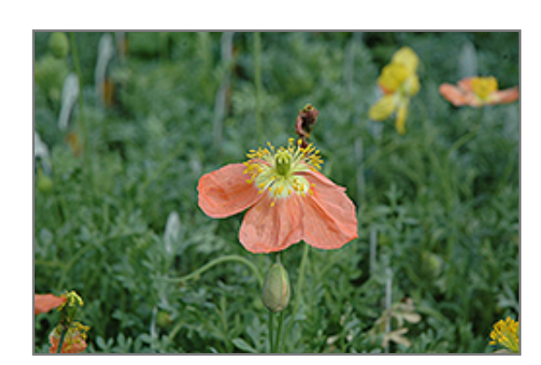
Alpine Poppy flowers