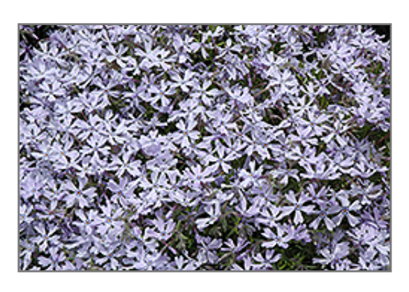
May Snow Moss Phlox flowers