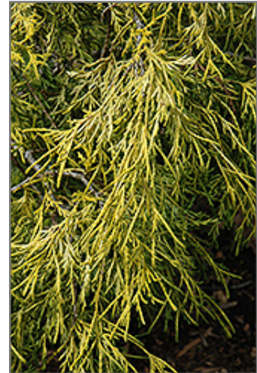
Lemon Thread Falsecypress foliage