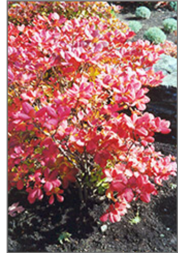
Royal Azalea in fall

This shrub does best in a location that gets morning sunlight but is shaded from the hot afternoon sun, although it will also grow in partial shade. Keep it away from hot, dry locations that receive direct afternoon sun or which get reflected sunlight, such as against the south side of a white wall. It requires an evenly moist well-drained soil for optimal growth, but will die in standing water. It may require supplemental watering during periods of drought or extended heat. It is not particular as to soil pH, but grows best in rich soils. It is somewhat tolerant of urban pollution, and will benefit from being planted in a relatively sheltered location. Consider applying a thick mulch around the root zone in winter to protect it in exposed locations or colder microclimates. This species is not originally from North America.