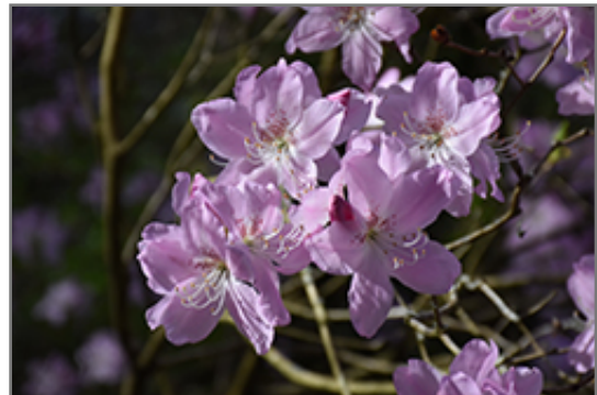
Royal Azalea flowers