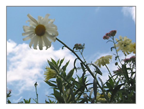
Sunshine Shasta Daisy flowers