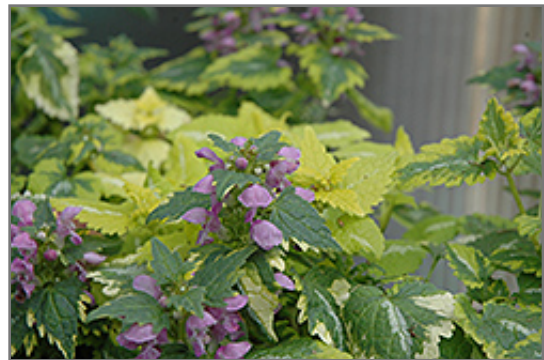
Anne Greenaway Spotted Dead Nettle flowers