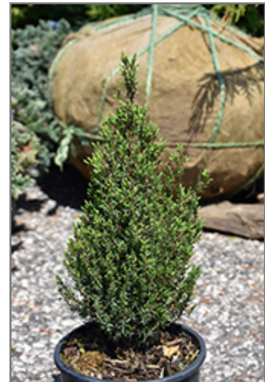
Miniature Juniper