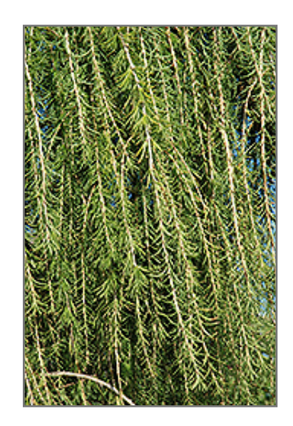
Puli Weeping Larch foliage

8546 Sun Valley Road Anytown, USA 12345 204.782.4147