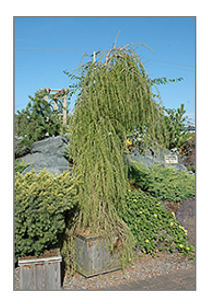
Puli Weeping Larch

This shrub does best in full sun to partial shade. It is quite adaptable, prefering to grow in average to wet conditions, and will even tolerate some standing water. It may require supplemental watering during periods of drought or extended heat. It is not particular as to soil type or pH. It is somewhat tolerant of urban pollution. This is a selected variety of a species not originally from North America.