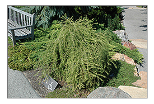
Puli Weeping Larch

Puli Weeping Larch is recommended for the following landscape applications;