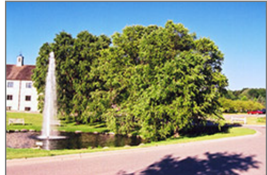
River Birch