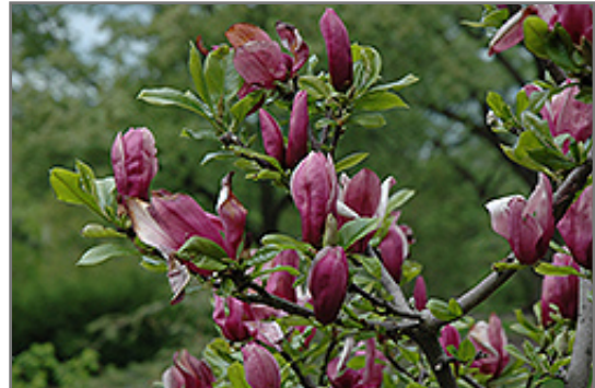
Lily Magnolia flowers