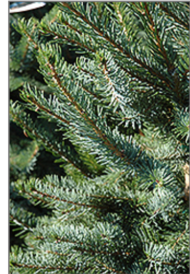
Brun's Spruce foliage