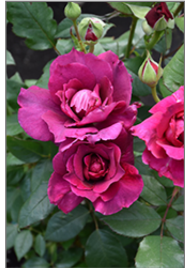
Intrigue Rose flowers