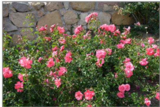
Lady Elsie May Rose in bloom