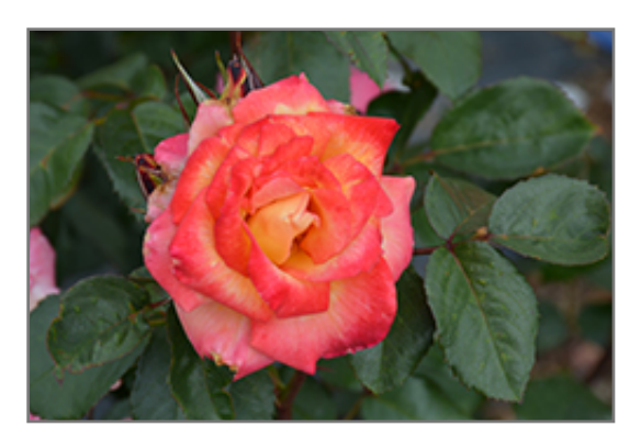
Rainbow Sorbet Rose flowers

Rainbow Sorbet Rose is recommended for the following landscape applications;