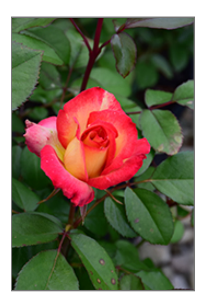
Rainbow Sorbet Rose flowers