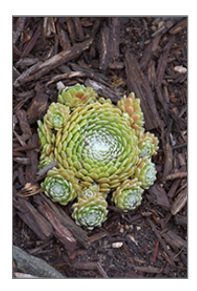
Robin Hens And Chicks