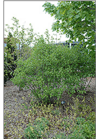
Red Regal Viburnum