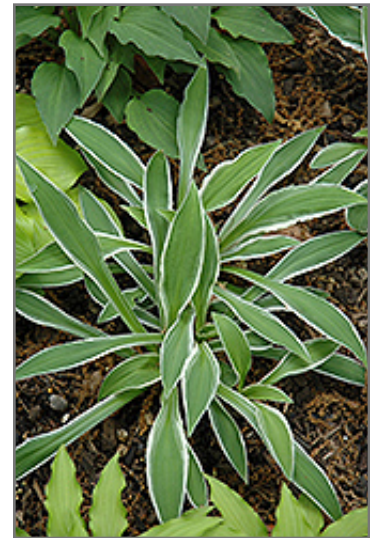
Ginkgo Craig Hosta

Ginkgo Craig Hosta is recommended for the following landscape applications;