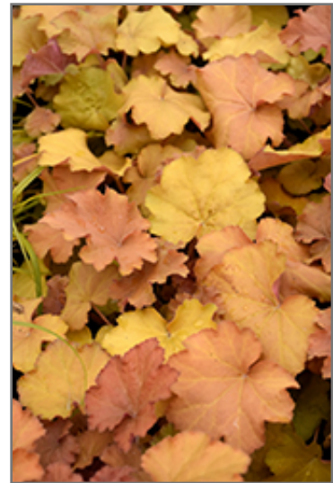
Caramel Coral Bells foliage

Caramel Coral Bells is recommended for the following landscape applications;