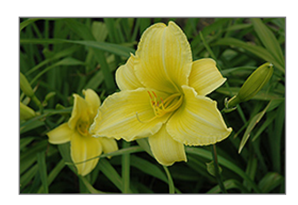
Eenie Weenie Daylily flowers