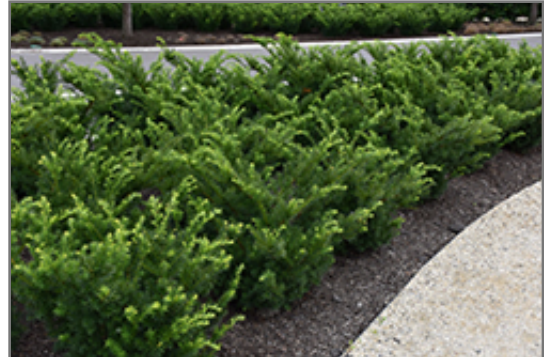
Densiformis Yew