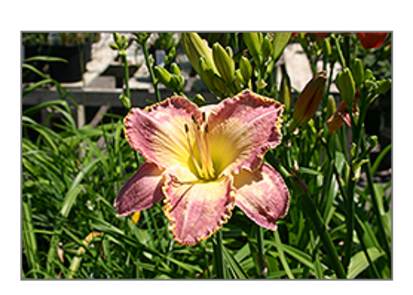
Spiritual Corridor Daylily flowers

Showy, large, lavender-pink trumpets lit with a creamy halo and creamy picotee edge, yellow-green throat; prominent ruffled edge; sturdy, strong, easy to care for, great grassy texture and form; good for the beginner gardener and the pro