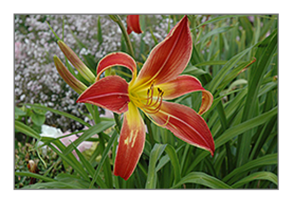
Long Stocking Daylily flowers