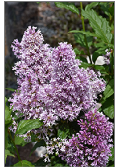
Donald Wyman Lilac flowers