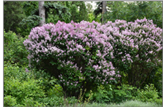
Donald Wyman Lilac in bloom